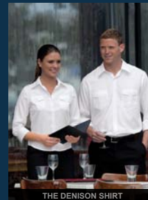
THE DENISON SHIRT

"If you work in the hospitality sector you need to look professional and respectable. Workwear must also allow you to do your job, whether you work in an office, in a bar or in a hotel".