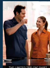
THE LIMITED TEFLON® SHIRT