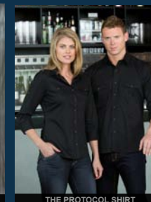
THE PROTOCOL SHIRT