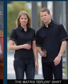
THE MATRIX TEFLON® SHIRT