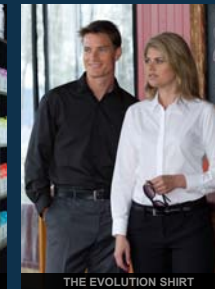
THE EVOLUTION SHIRT