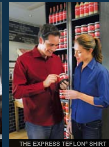
THE EXPRESS TEFLON® SHIRT